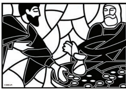
33<sup>rd</sup> Sunday in Ordinary Time ~ 19 November 2017

"After a long time the master of those slaves came and settled accounts with them. Then the one who has received the five talents came forward, bringing five more talents;" Matt 25:19-20