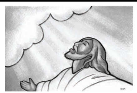
2<sup>nd</sup> Sunday of Lent ~ 25 February 2018

Then a cloud overshadowed them, and from the cloud there came a voice, "This is my Son, the Beloved; listen to him!" Suddenly when they looked around, they saw no one with them anymore, but only Jesus.