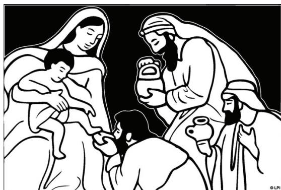
The Epiphany of the Lord ~ 6 January 2019

When they saw that the star had stopped, they were overwhelmed with joy. On entering the house, they saw the child with Mary his mother; and they knelt down and paid homage. Then, opening their treasure chests, they offered him gifts of gold, frankincense, and myrrh. Matt 2:10-11