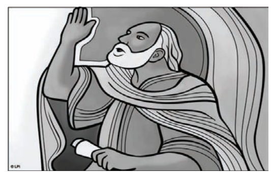
6<sup>th</sup> Sunday in Ordinary Time ~ 16 February 2020

"Again, you have heard that it was said to those of ancient times, 'You shall not swear falsely, but carry out the vows you have made to the Lord.' But I say to you: Do not swear at all. Let your word be 'Yes,' if 'Yes,' or 'No,' if 'No'; anything more than this comes from the evil one." Mt 5:33-34a, 37