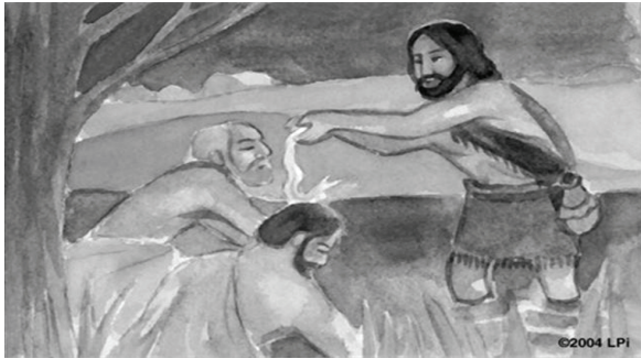
3 rd Sunday of Advent ~ 12 December 2021

As the people were filled with expectations, and all were questioning in their hearts concerning John, whether he might be the Messiah, John answered all of them by saying, "I baptized you in water; but one who is more powerful than I is coming." Luke 3:15-16a