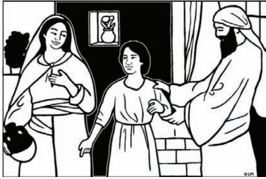
Holy Family of Jesus, Mary and Joseph 26 December 2021

Then he went down with them and came to Nazareth, and was obedient to them. His mother treasured all these things in her heart. And Jesus increased in wisdom and in years, and in favour with God and human beings. Luke 2:51-52