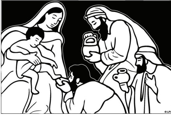
The Epiphany of the Lord ~ 2 January 2022

When they saw that the star had stopped, they were overwhelmed with joy. On entering the house, they saw the child with Mary his mother; and they knelt down and paid homage. Then, opening their treasure chests, they offered him gifts of gold, frankincense, and myrrh.