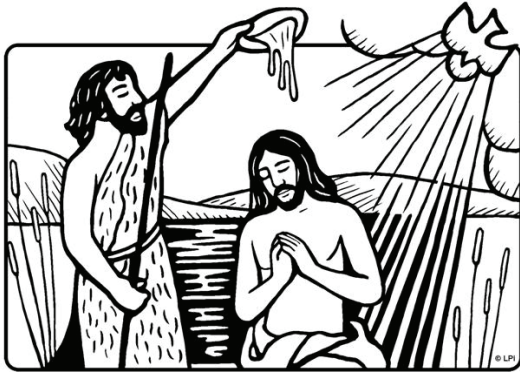
Baptism of The Lord ~ 9 January 2022

"I baptize you with water; but one who is more powerful than I is coming; I am not worthy to untie the thong of his sandals. He will baptize you with the Holy Spirit and fire." Luke 3:16 b c