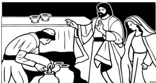
2 nd Sunday in Ordinary Time ~ 16 January 2022

When the wine gave out, the mother of Jesus said to him, "They have no wine." And Jesus said to her. "Woman, what concern is that to you and me? My hour has not yet come." His mother said to the servants, "Do whatever he tells you." John 2:3-5