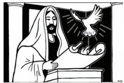
3<sup>rd</sup> Sunday in Ordinary Time ~ 23 January 2022

"The Spirit of the Lord is upon me, because he has anointed me to bring good news to the poor. He has sent me to proclaim release to the captives and recovery of sight to the blind, to let the oppressed go free... Luke 4:18