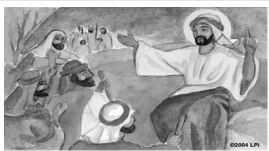
6<sup>th</sup> Sunday in Ordinary Time ~ 13 February 2022

"Blessed are you who are poor, for yours is the kingdom of God. Blessed are you who are hungry now, for you will be filled." Luke 6:20-21