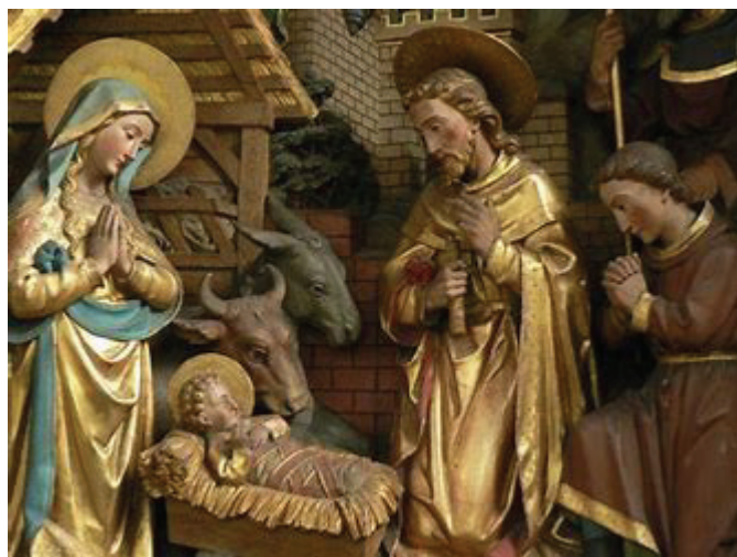
THE NATIVITY OF THE LORD-DEC 25, 2022

So they went in haste and found Mary and Joseph, and the infant lying in the manger. When they saw this, they made known the message that had been told them about this child. All who heard it were amazed by what had been told them by the shepherds. And Mary kept all these things, reflecting on them in her heart. Luke 2:16-19