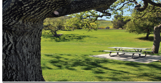
Save the date: - Sunday August 20 th