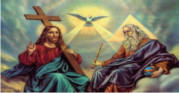
The Most Holy Trinity ~ 4 June 2023

“God so loved the world that he gave his only -begotten Son, so that everyone who believes in him may not perish but may have eternal life.” John 3:16-17