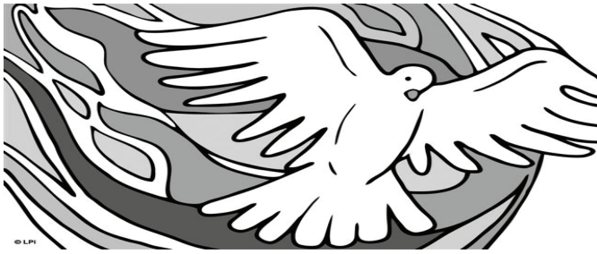
Pentecost Sunday ~ 19 May 2024

“I still have many things to say to you, but you cannot bear them now. When the Spirit of truth comes, he will guide you into all the truth; for he will not speak on his own, but will speak whatever he hears, and he will declare to you the things that are to come. He will glorify me.” John 16:12-14a