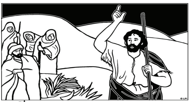
2<sup>nd</sup> Sunday of Advent ~ 8 December 2024

"The voice of one crying out in the wilderness: 'Prepare the way of the Lord, make his paths straight.' Luke 3:4