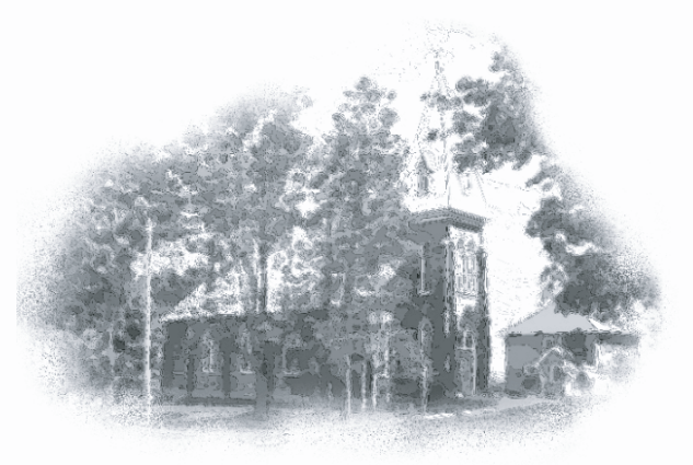
"To grow as disciples, living and sharing the love of Christ"