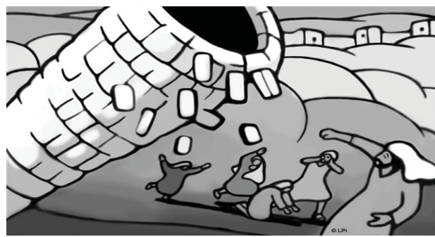
23 March 2025 ~ 3rd Sunday of Lent

Jesus said to them in reply, "Do you think that because these Galileans suffered in this way they were greater sinners than all other Galileans? By no means! But I tell you, if you do not repent, you will all perish as they did!" — Lk 13:2-3