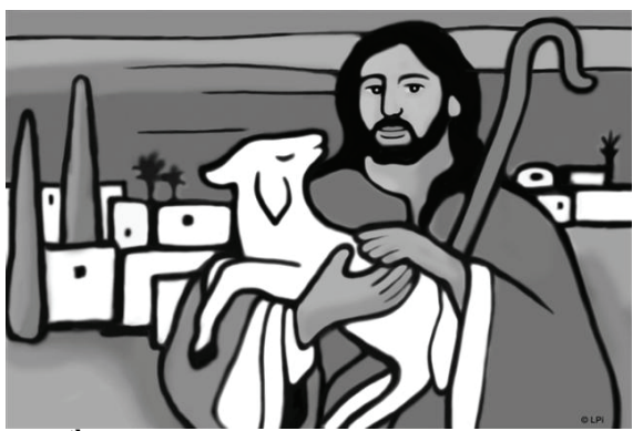
4<sup>th</sup> Sunday of Easter ~ 11 May 2025

Excerpts from the Lectionary for Mass @2001, 1998, 1970 CCD.