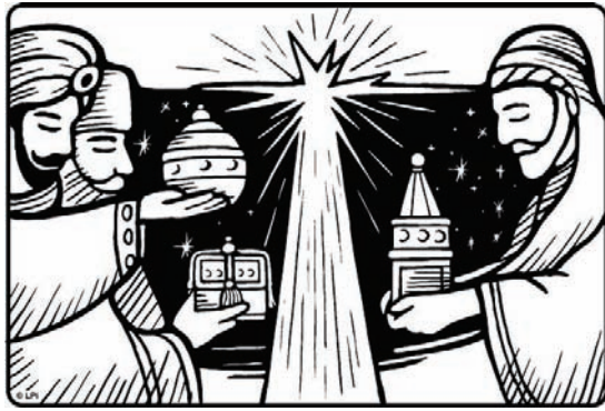
Epiphany of the Lord ~ 4 January 2026

When they saw that the star had stopped, they were overwhelmed with joy. On entering the house, they saw the child with Mary his mother; and they knelt down and paid him homage. Then, opening their treasure chests, they offered him gifts of gold, frankincense, and myrrh.