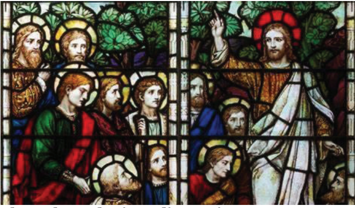
Eleventh Sunday in Ordinary Time- 14 June, 2026

At the sight of the crowds, his heart was moved with pity for them because they were troubled and abandoned, like sheep without a shepherd. Then he said to his disciples, "The harvest is abundant but the laborers are few; so ask the master of the harvest to send out laborers for his harvest." Matthew 9:36-38